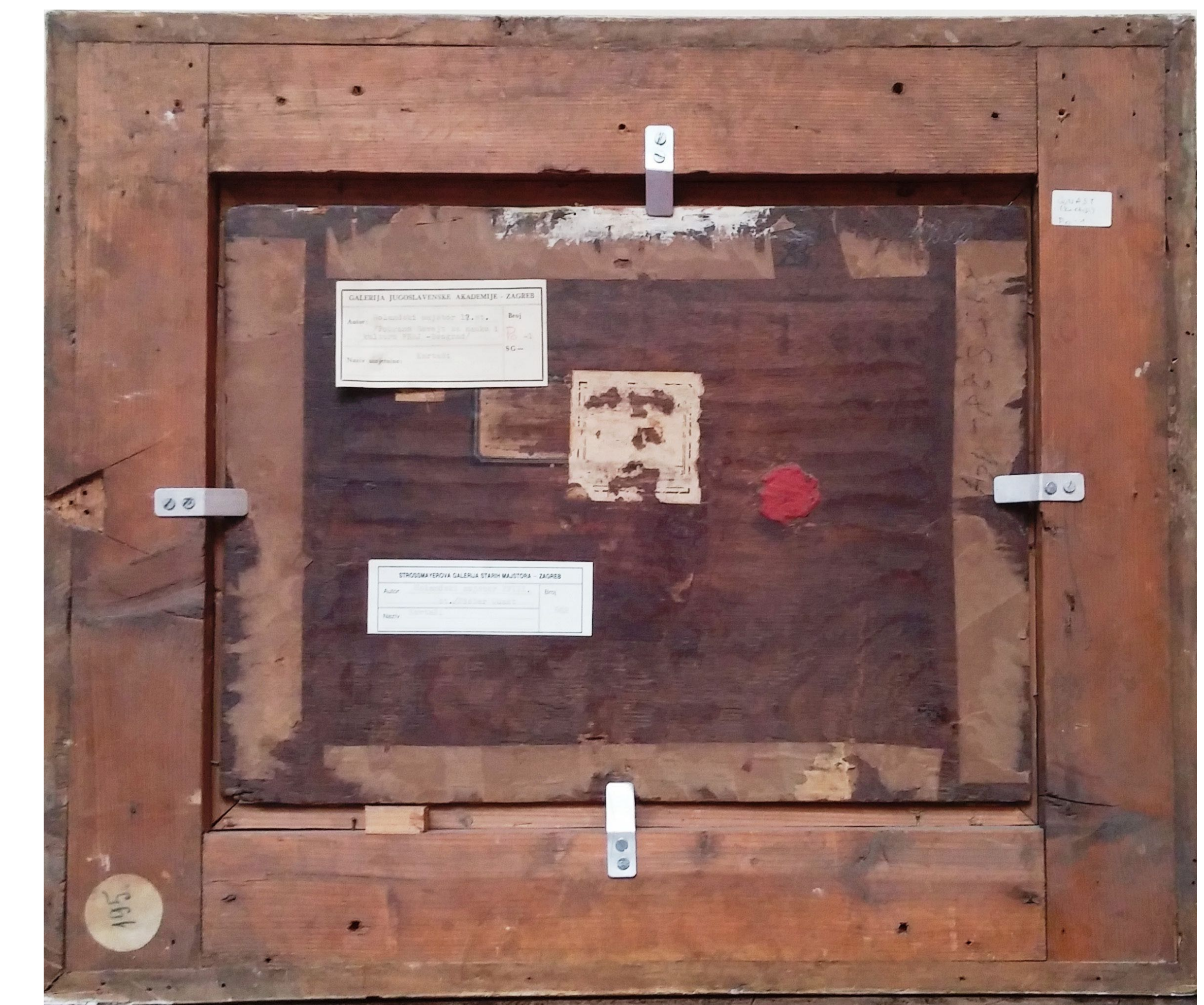
Poledina slike Kartaši