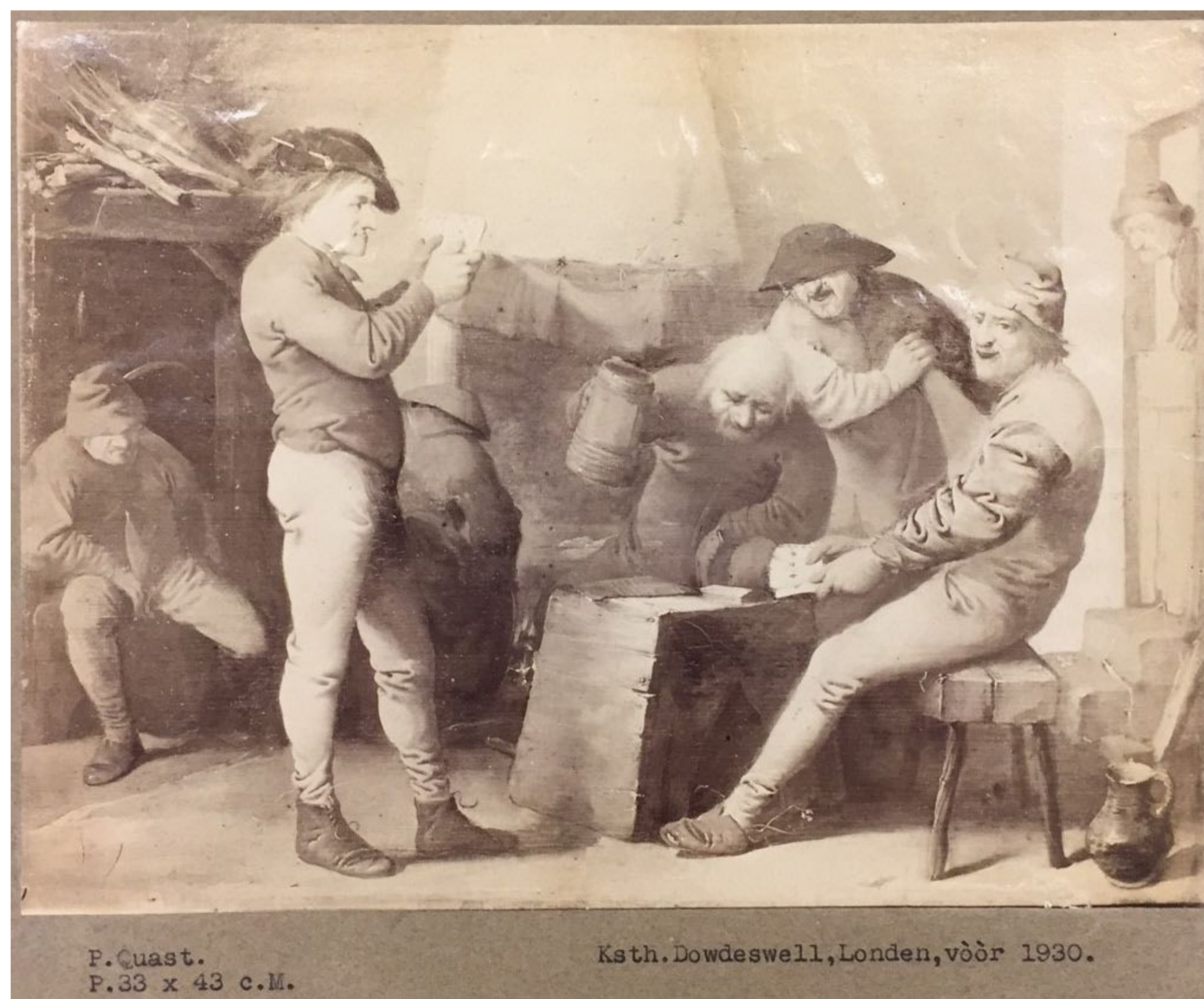
P. Quast. P. 33 x 43 c.M.