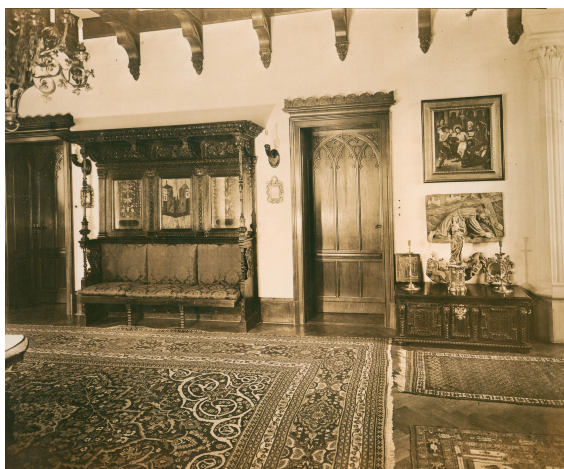
Interijer vile Radovan, Josipovac (Mošinska, današnja Nazorova 56), 1941. Interior of the Radovan Villa, Josipovac (Mošinska, today's Nazorova 56), 1941