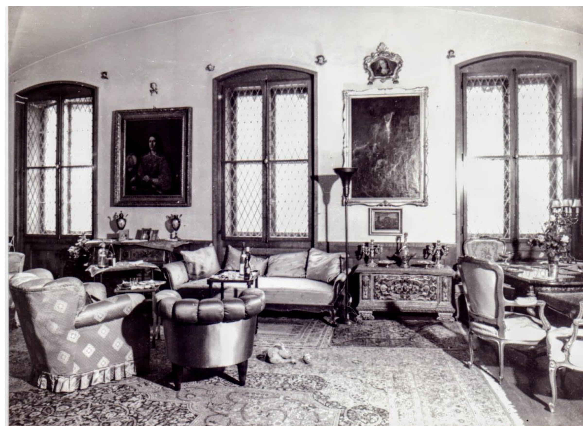
Interijer stana Kamile Radovan, Basaričekova ulica 24, Zagreb, 1976. Interior of Kamila Radovan's apartment, Basaričekova Street 24, Zagreb, 1976.