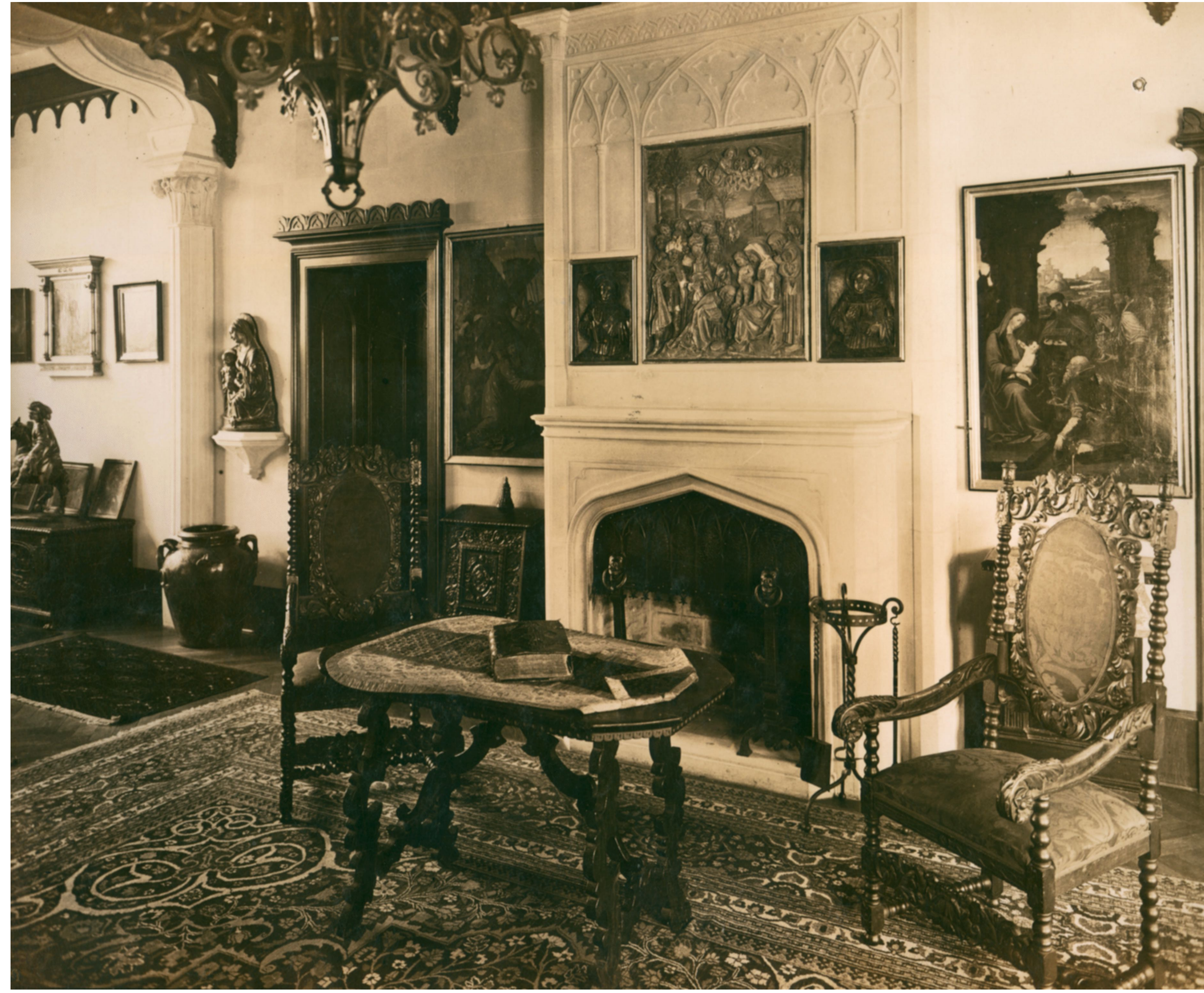
Interijer vile Radovan, Josipovac (Mošinska, današnja Nazorova 56), 1941. Interior of the Radovan Villa, Josipovac (Mošinska, today's Nazorova 56), 1941