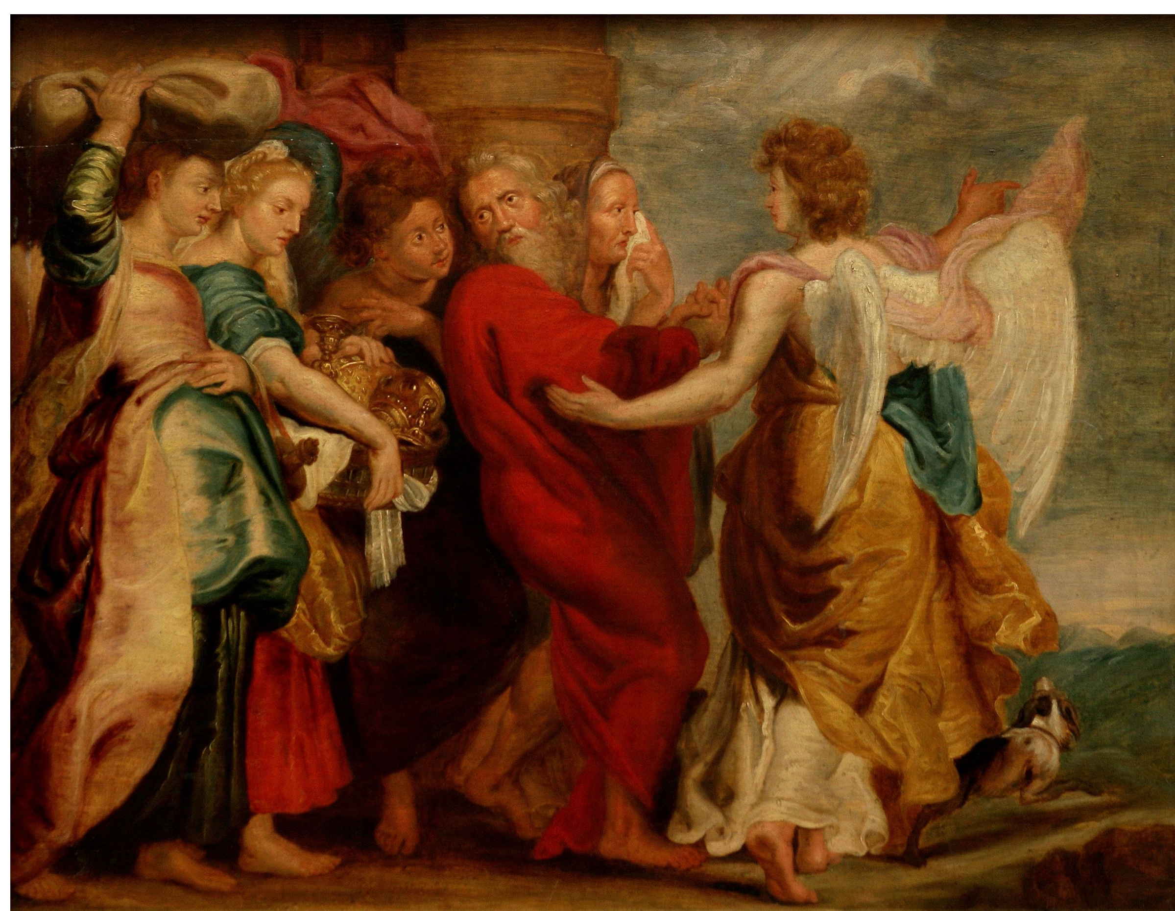
Prema: Peter Paul Rubens, Bijeg Lota i njegove obitelji iz Sodome, 1620.-30., ulje na dasci, 51 x 65 cm, Strossmayerova galerija starih majstora HAZU, inv. br. SG-633 After: Peter Paul Rubens, The Flight of Lot and his Family from Sodom, 1619-38, oil on panel, 51 x 65 cm, The Strossmayer Gallery of Old Masters, inv. no. SG-633