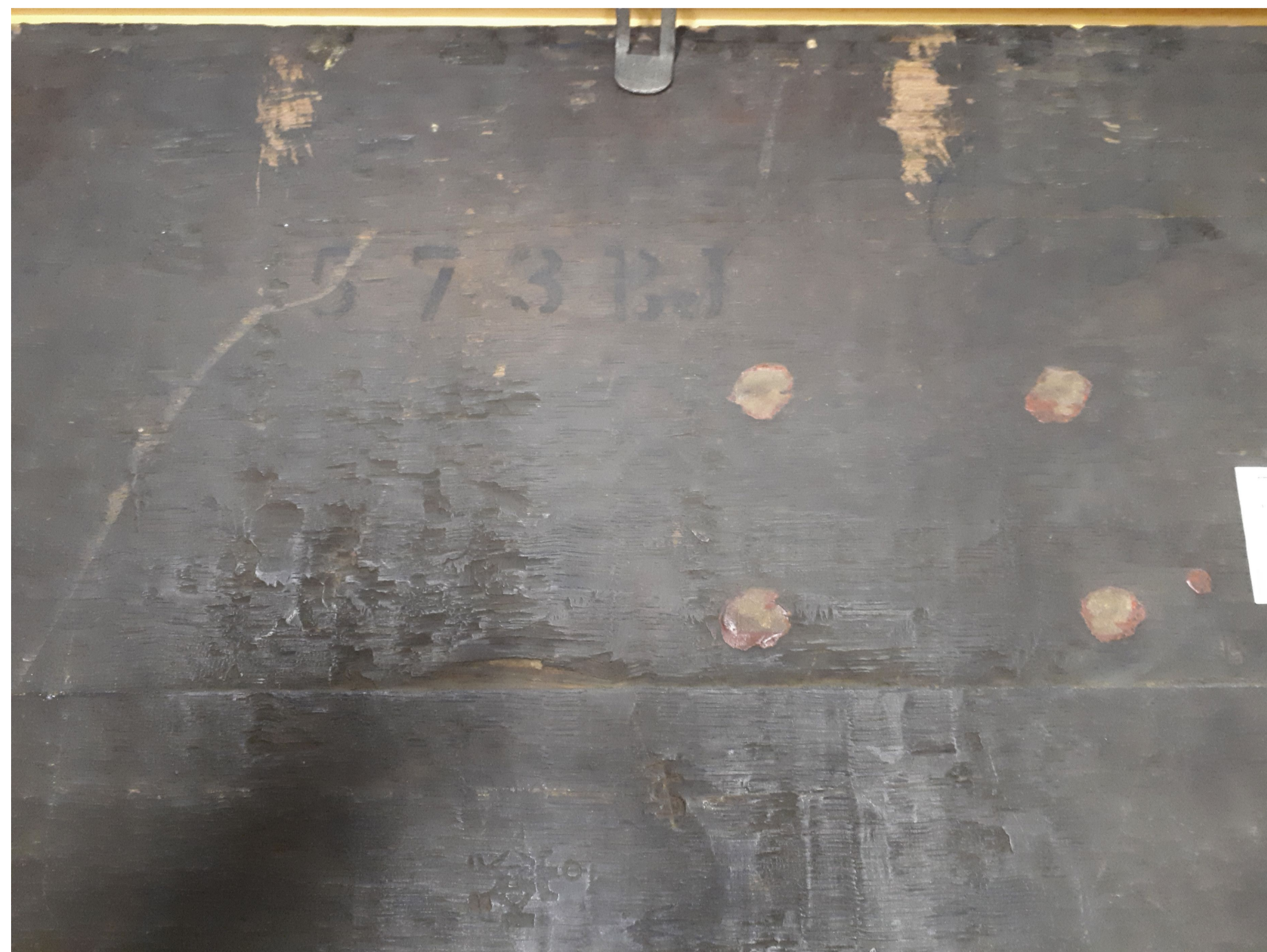
Christie'sova oznaka, detalj poledine slike Bijeg Lota i njegove obitelji iz Sodome Christie's marking, detail from the back of the painting The Flight of Lot and his Family from Sodom