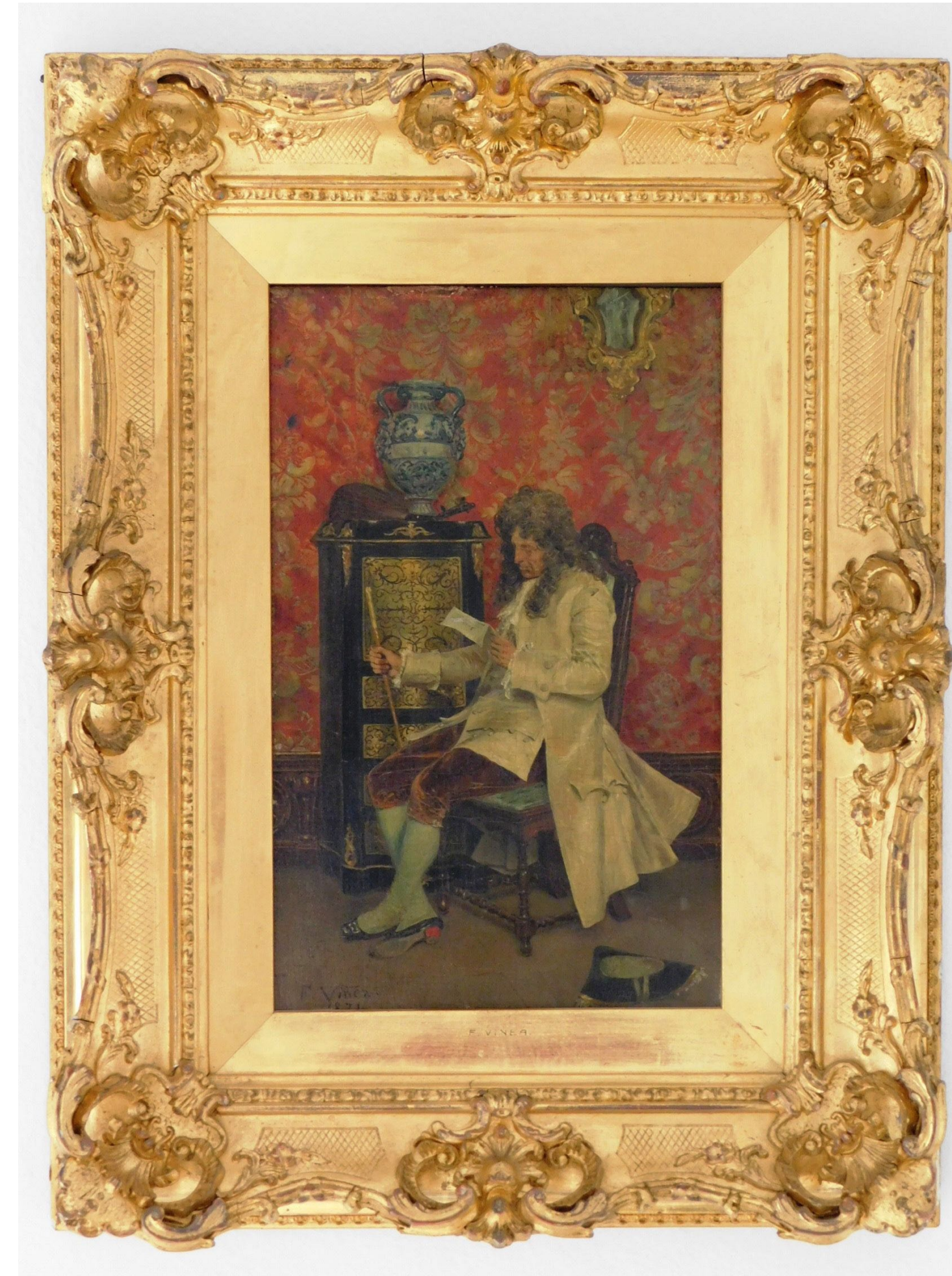
Francesco Vinea, Markiz , 1874., ulje na dasci, 30,5 x 19 cm, uokvirena bogato rezbarenim drvenim pozlaćenim okvirom (dimenzije s okvirom: 48 x 36,7 cm) Francesco Vinea, The Marquis , 1874., oil on panel, 30.5 x 19 cm, framed in a richly decorated gilded wooden frame (dimensions with frame: 48 x 36.7 cm)