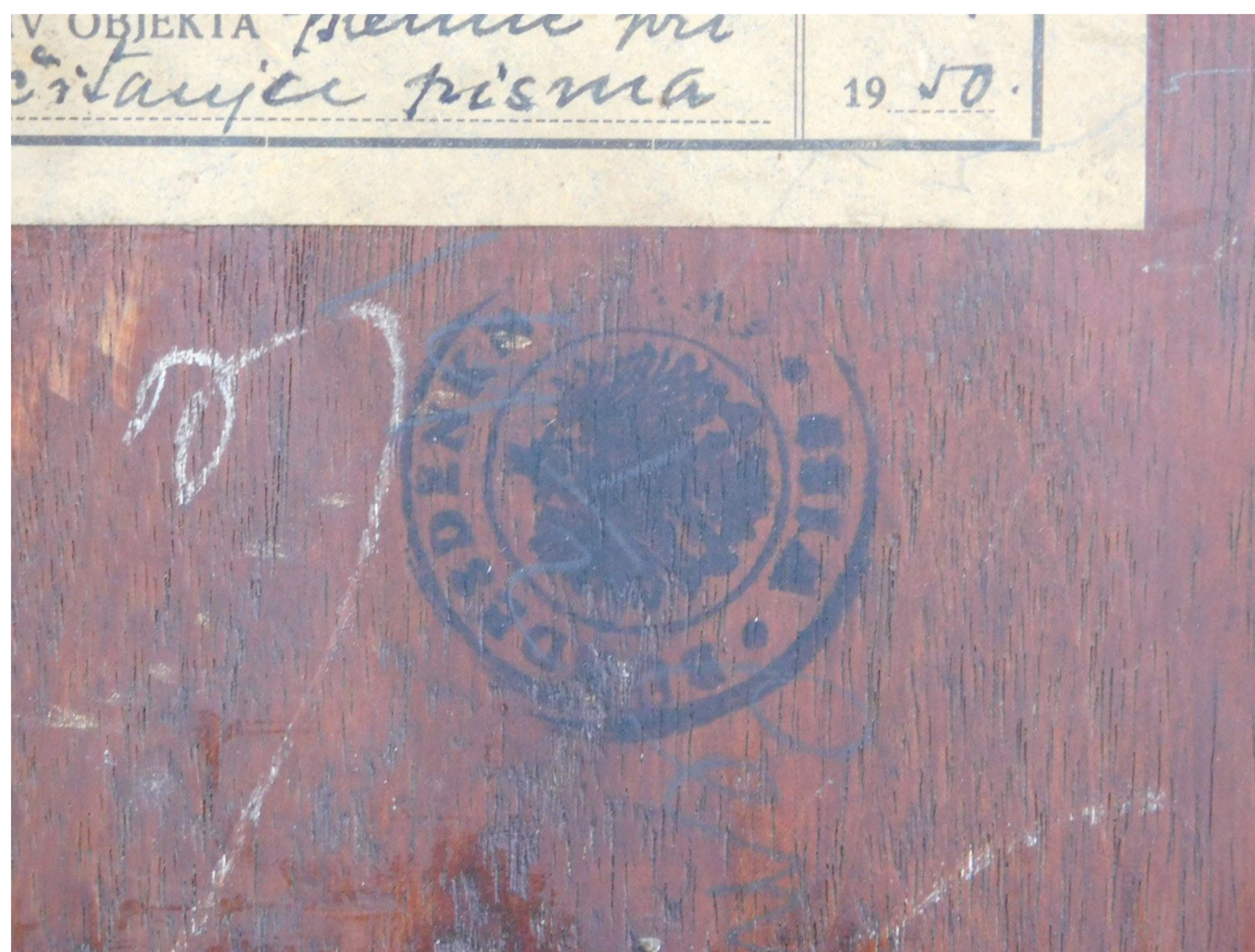
Poledina slike, detalj: žig Bundesdenkmalamt Wien Back of the painting, detail: seal of the Bundesdenkmalamt Wien